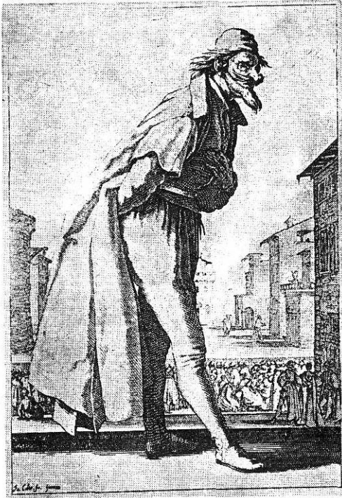
Seventeenth-century engraving of Pantalone by Jacques Callot.

CAST: Dr. Heart - a charlatan Coviello - father of Lurette and Saccherina Pantalone - a hypochondriac, father of Honestia Lelio - in love with Honestia Georgio - Lelio's friend Lurette - Coviello's daughter, a sister to Saccherina Puella - maid to Lurette and Saccherina Saccherina - Coviello's daughter, sister to Lurette Servette - maid to Honestia Honestia - daughter of Pantalone Zanni - Pantalone's servant